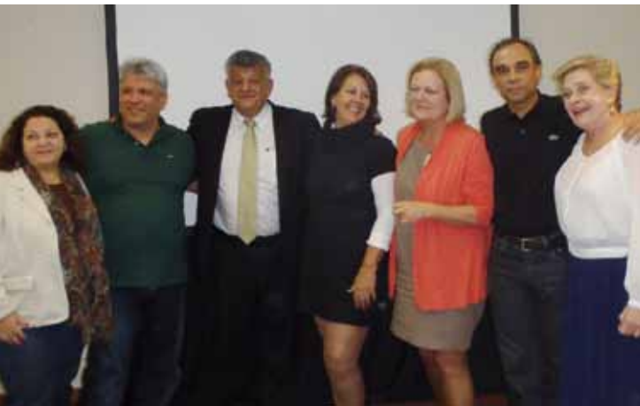
Participants of the Rio Meeting

paths, including dentists, pharmacists and veterinarians in Brazil. In recent years, the situation of homeopathy in Brazil has been undergoing an expansion process and homeopathy has become a part of the Brazilian Public Health System, thus providing significant sustainable support to the PNPIC, the National Policy for the Integrative and Complementary Practices within the Brazilian Unique Health System SUS. "Such results were achieved through significant contributions given by all colleagues working for the public health system in our country", stated the LMHI's Contact Person for Brazil in his Country Report 2011.