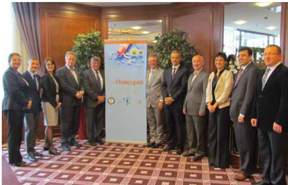
IHD meeting with Turkish Health Ministry

The Turkish Classical Homeopathy Association (ACHA), the Liga Medicorum Homeopathica Internationalis (LMHI) and the European Committee for Homeopathy (ECH) jointly celebrated the International Homeopathy Day 2012 in Turkey from 26-29 April 2012 to promote the public's and the medical community's awareness of homeopathy in Turkey. The meetings with the Turkish government in Ankara and the International Symposium on Homeopathy, held in Izmir, brought together important international and Turkish stakeholders to exchange information about the homeopathic medical doctrine, the current legal framework of medical doctors practicing homeopathy in all continents, its contribution to European and worldwide healthcare systems, as well as the current status of